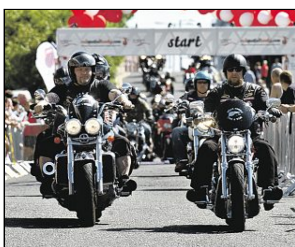
ON TWO WHEELS: The motorcycle parade which took place as part of the 10K run.