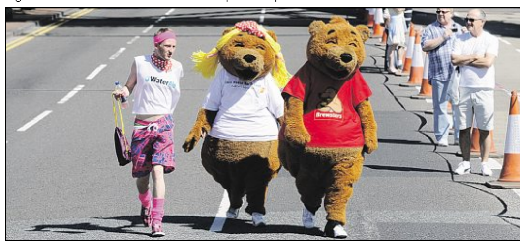
SLOW GOING: Fancy dress runners feel the heat during the run.